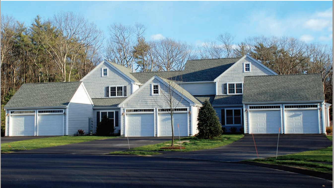
The Village at Walnut Creek, Hanover, MA