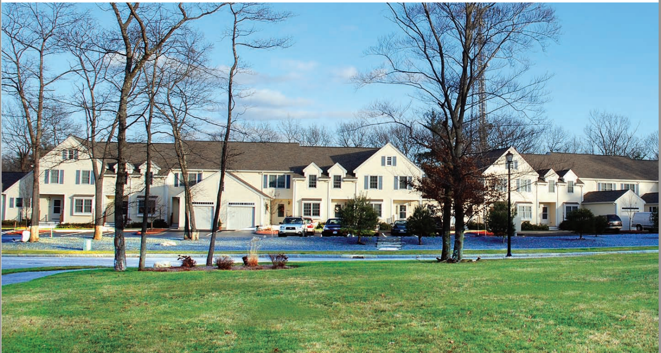
Bedford Woods, Abington, MA