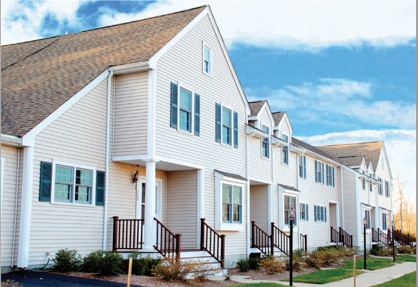
Bedford Woods, Abington, MA