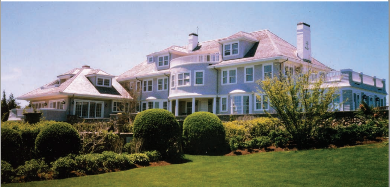
Penazance Point, Falmouth, MA